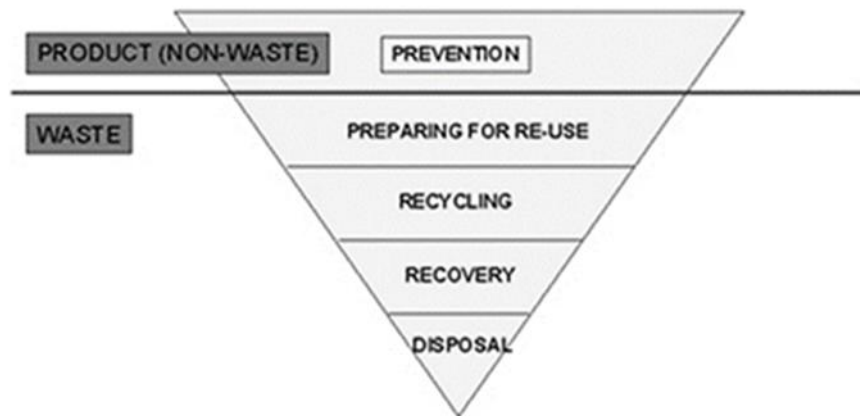
Figure 4-2: Waste Hierarchy